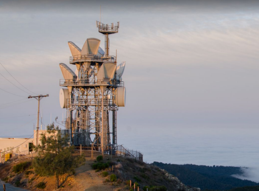
Loma Prieta